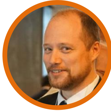
Group CEO Hofstede Insights Egbert Schram

CULTURE The collective programming of the mind